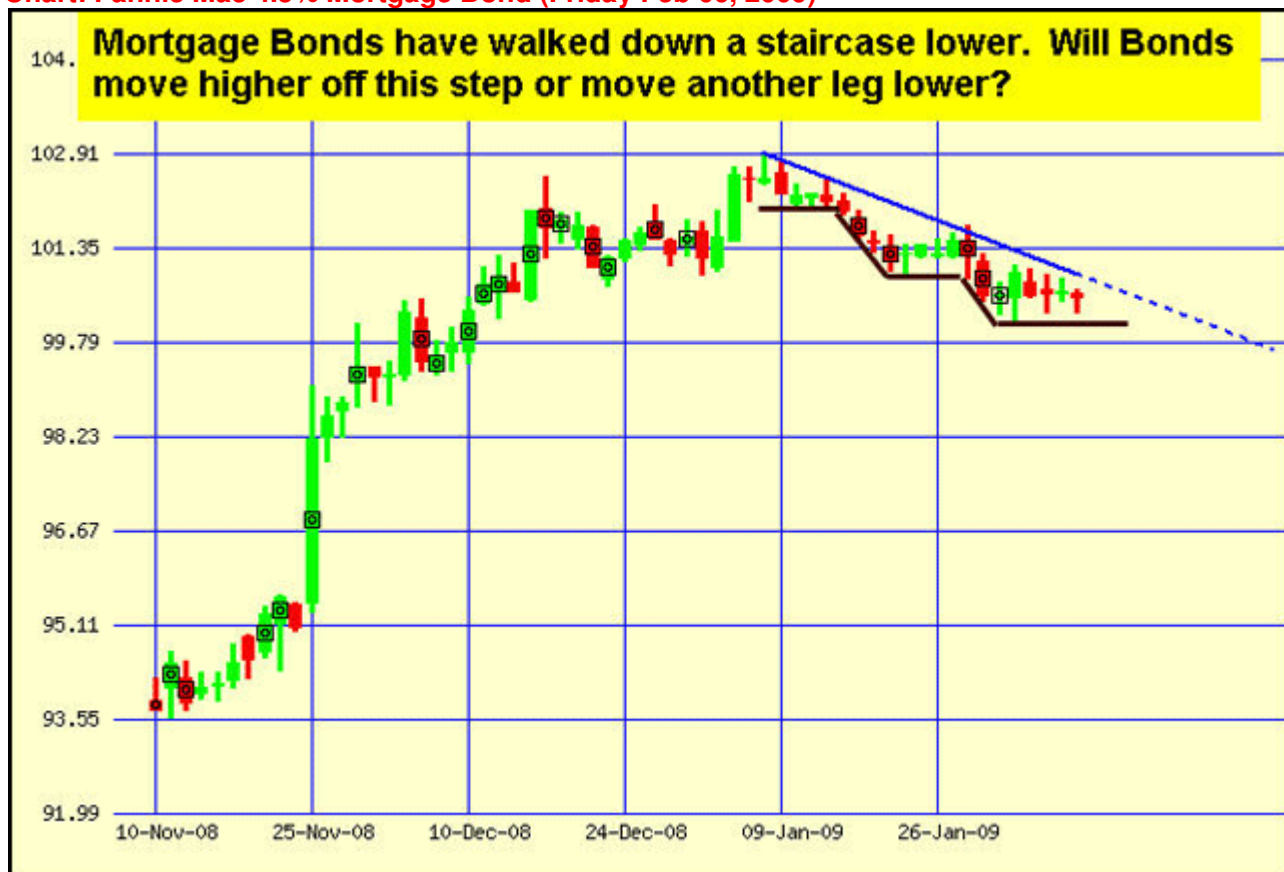
Chart: Fannie Mae 4.5% Mortgage Bond (Friday Feb 06, 2009)

Remember: Weak economic news normally helps Bonds and home loan rates improve, as money flows out of Stocks and into Bonds. As you can see in the chart below, Bonds and home loan rates have lost some ground and worsened in recent weeks. I will be watching closely to see what happens this week.